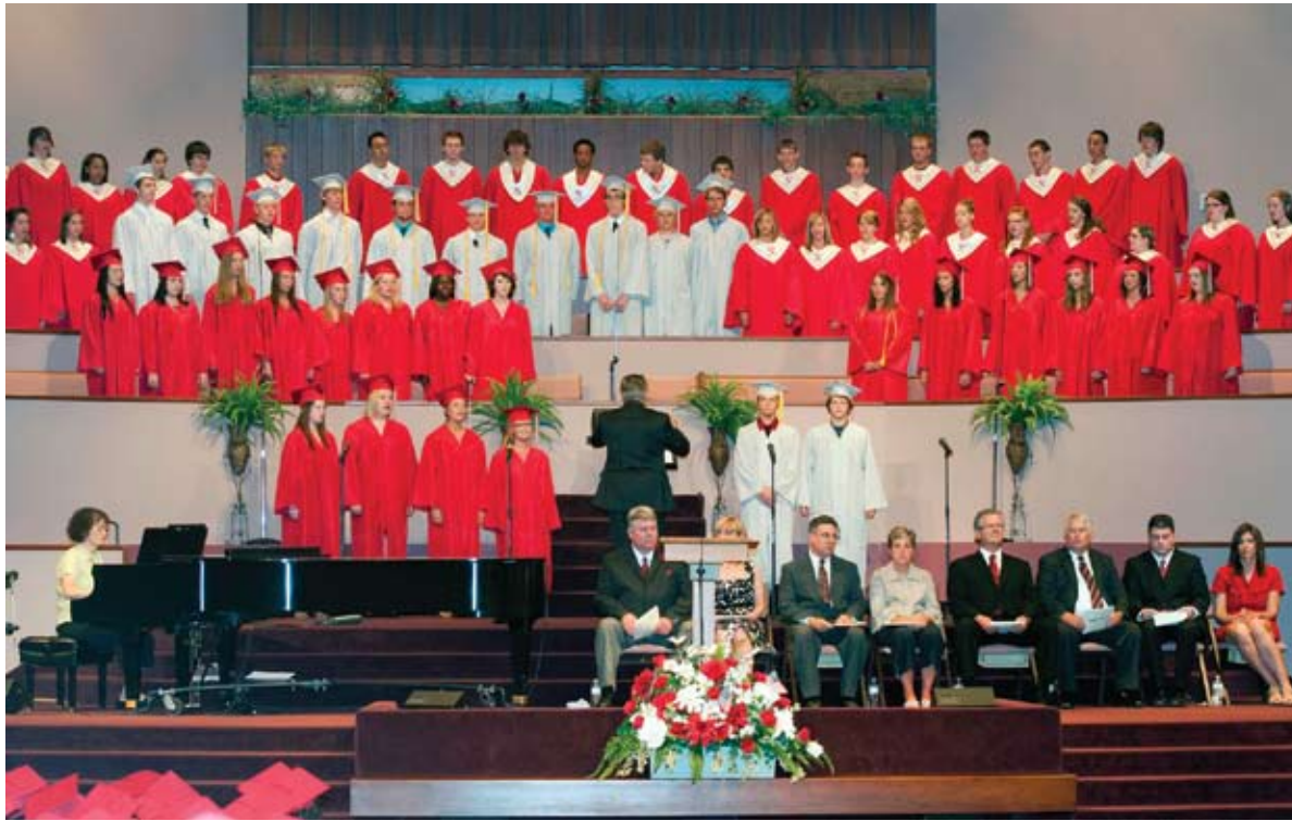
Northwest Graduating Class of 2010