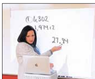
Stinson teachers connect with students remotely after winter break.