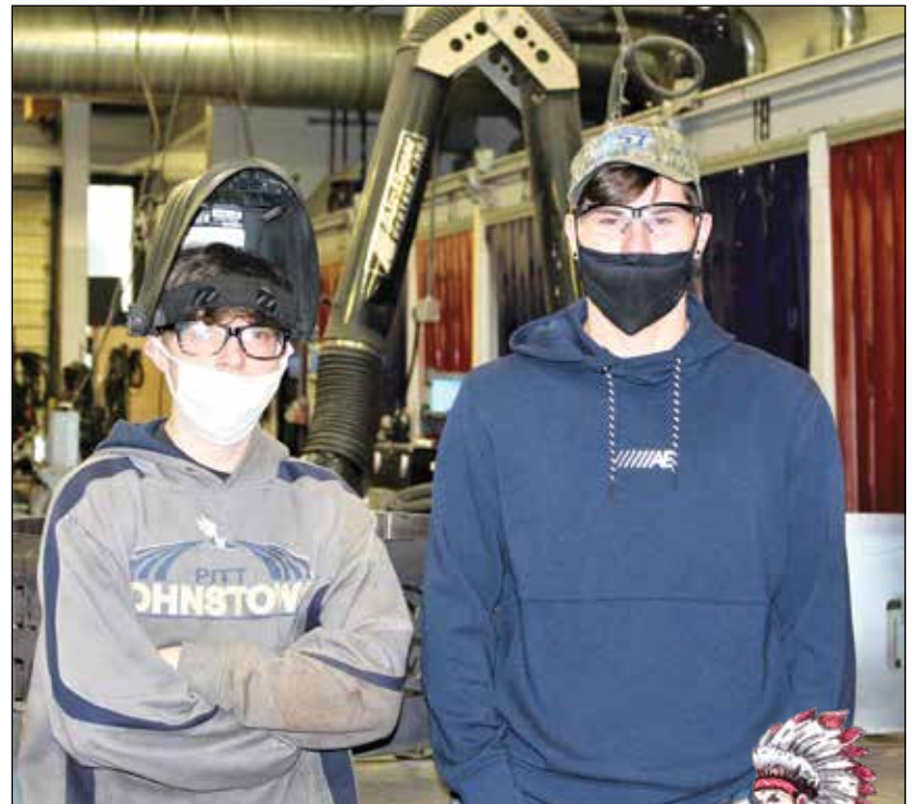
Masks removed for photos