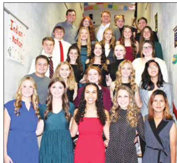
2021 NATIONAL HONOR SOCIETY INDUCTEES