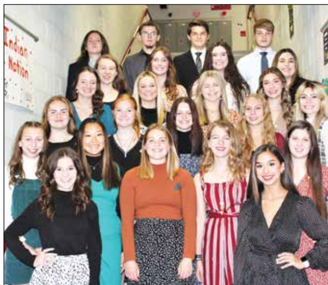
CURRENT NATIONAL HONOR SOCIETY MEMBERS