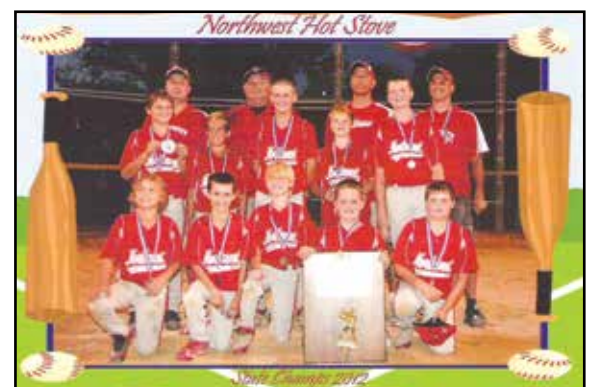
NW Indians Claim Championship