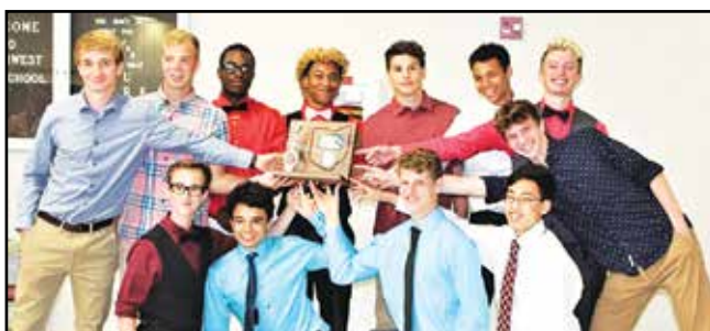
Boys District Runners Up