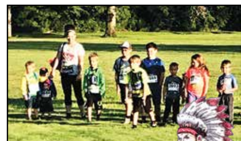
New this year: the Children's Fun Run.